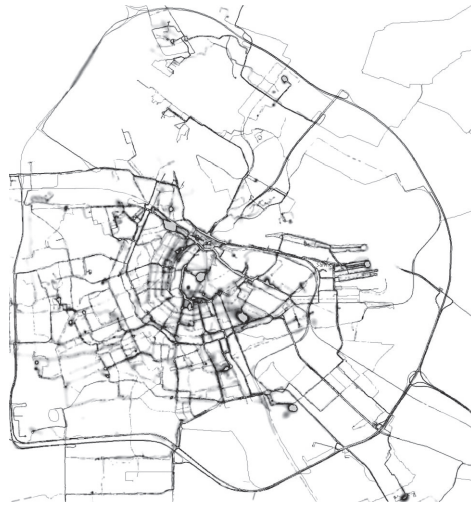
Figure 1: The Amsterdam Real Time project [20].

he moves about the city and the choices made in this process are determined by this mental map. Amsterdam Real Time attempted to visualize these mental maps through the mobile behaviour of the city's users' [20].